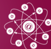
Peer to peer